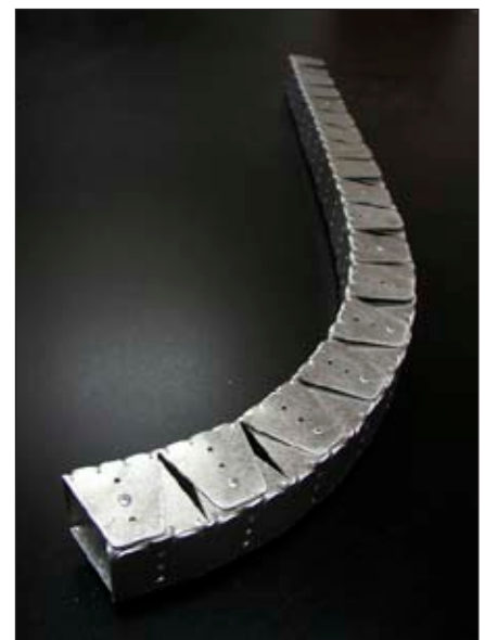
Figure 2. A curved beam used for wing reinforcement in aircraft.

used over 250 parts in its construction, whereas the IOI chassis uses a mere 64 total parts. A weight savings of approximately 10% is possible with the design, but the most significant savings are the reduced joining costs based on the reduced part count. According to IOI, depending on the model of car, the chassis has the potential to save hundreds of dollars per vehicle, while also enabling the opportunity to use higher tensile materials due to the ability to form geometries without material degradation and minimized welding requirements.